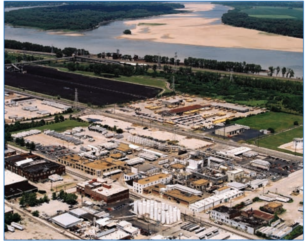
ELANTAS PDG, Inc. headquarters in St. Louis, Missouri

ELANTAS Electrical Insulation companies are strategically located throughout the world to meet the primary insulation, secondary insulation and electronic and engineering materials needs of our customers.