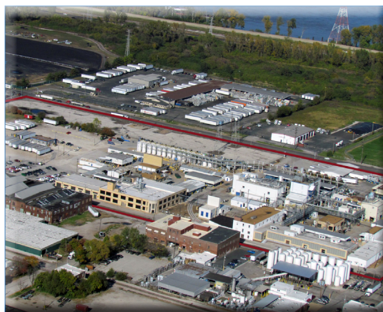
ELANTAS PDG, Inc. headquarters in St. Louis, Missouri

ELANTAS Electrical Insulation companies are strategically located throughout the world to meet the primary insulation, secondary insulation and electronic and engineering materials needs of our customers.